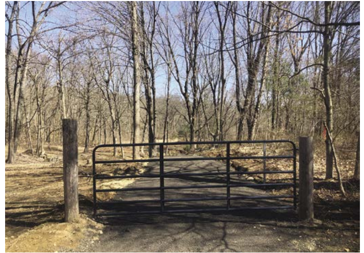
Hop River Preserve road with gate

SHPO administers the State Archaeological Preserve program – Connecticut’s flagship program for preserving significant archaeological finds, locations, and regions. The process often entails listing in the State Register of Historic Places. This honorary designation is the official list of structures and sites that characterize the historical development of the state. Although a site does not need to be listed in the registry for designation as a State Archaeological Preserve, the nomination paperwork creates a standard for conveying the significance of the site and listing comes with the additional incentive of being able to apply for several grant programs administered by SHPO to help interpret or protect the site. It is important for our sense of history and identity that archaeological sites be protected, but archaeological resources are rarely seen or experienced by the public so the current opportunity to create a preserve in Columbia is an exciting addition to the other 37 State Archaeology Preserves.