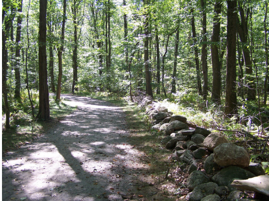
Columbia Recreation Park

Columbia trails - www.columbia.org/trails